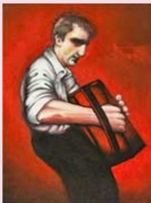
Unique character of the single individual.

[6] Anyone who judges human beings according to their generic character stops short at the very point beyond which they begin to be individuals whose activity rests on free self-determination. Whatever lies short of this point may naturally become matter for scientific study. Thus the characteristics of race, tribe, nation, and sex are the subject-matter of special sciences. Only men who wish to live as nothing more than examples of the genus could possibly conform to the generic picture which the methods of these sciences produce.